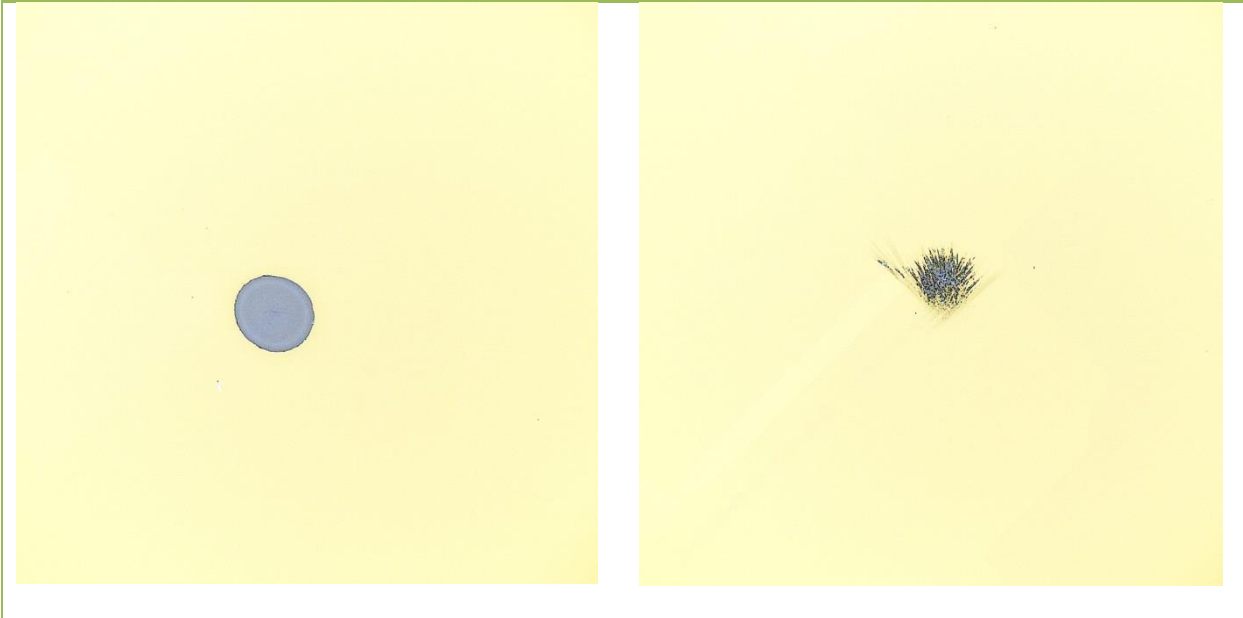
Optoman Sample B: multi pulse damage